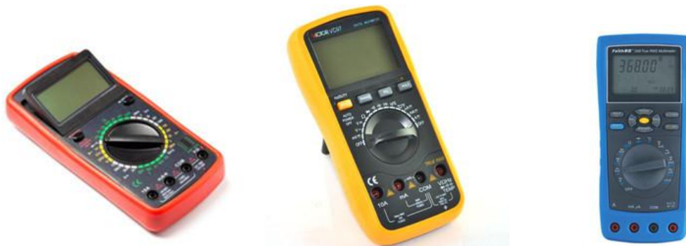
LCD for Multimeter